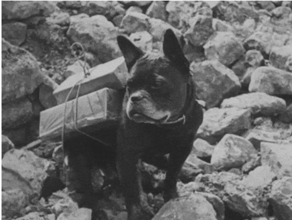
Mutt, the YMCA delivery dog.