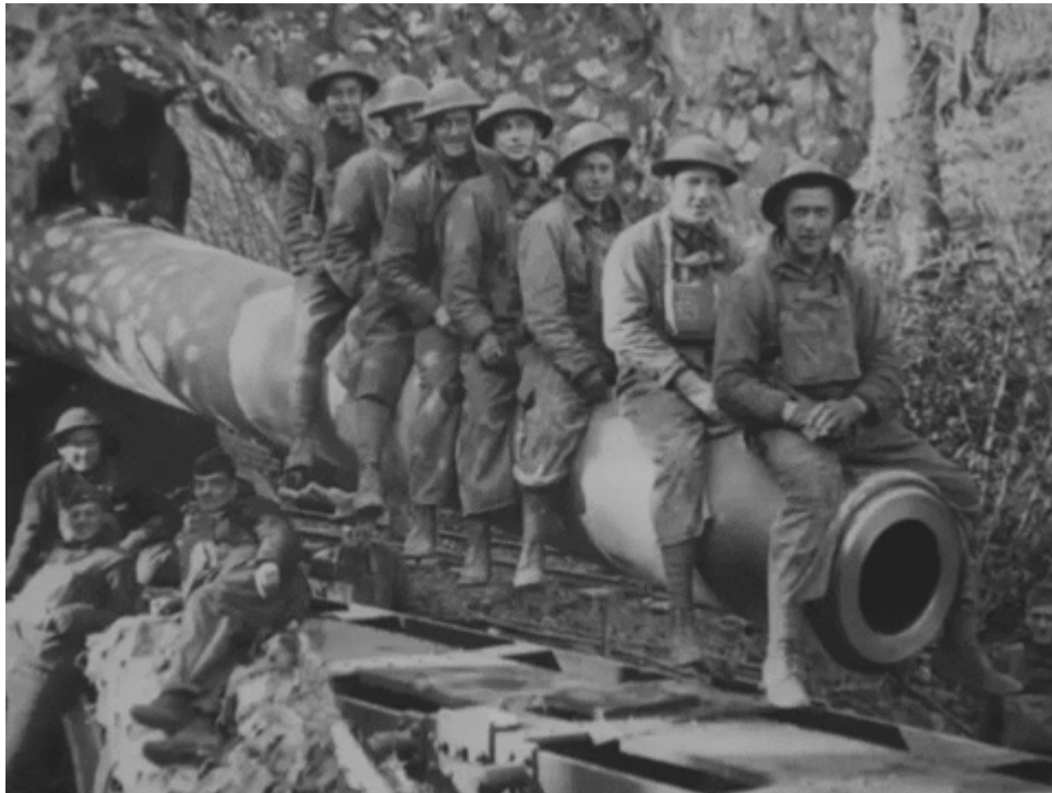
Members of the 53rd Coast Artillery Regiment. (From 111-H-1409 , National Archives Identifier 24911)

This series features footage captured by the U.S. Army Signal Corps as early as 1914, highlighting activities of the Army during World War I. Much of the footage is typical of wartime photography, depicting distant, smoke-filled battlefields and displays of artillery in action. Off the battlefield, however, the cameramen of the Signal Corps focused on individual subjects, capturing intimate moments of smiling officers and shy civilians alike. In the scene below, members of the 53rd Coast Artillery Regiment sit atop a 340 mm railway gun nicknamed “Reveille Kate.”