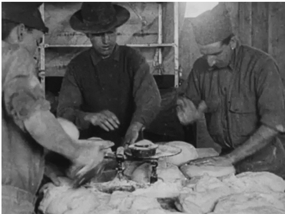
“Scenes of Quartermaster Bakeries in the A.E.F.” (From 111-H-1515 , National Archives Identifier

Many of the films in this series cover non-combat aspects of wartime efforts, such as this Quartermaster bakery producing mass amounts of bread for the U.S. Army: