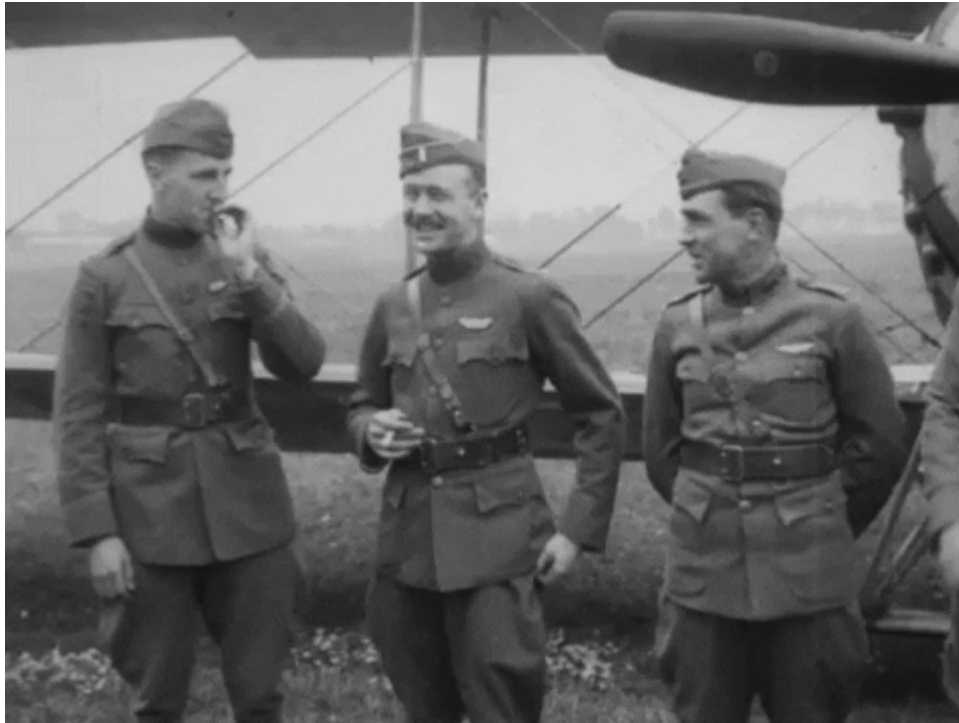
Members of the 91st Aero Squadron. (From 111-H-1513 , National Archives Identifier 25014)

Many of the films in this series cover non-combat aspects of wartime efforts, such as this Quartermaster bakery producing mass amounts of bread for the U.S. Army: