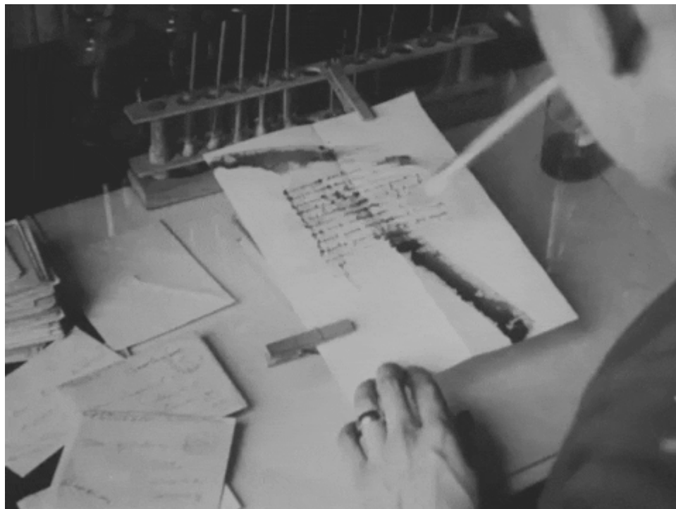
A postal worker reveals invisible ink.

In this film, the postal service tests incoming letters for hidden messages written in invisible ink: